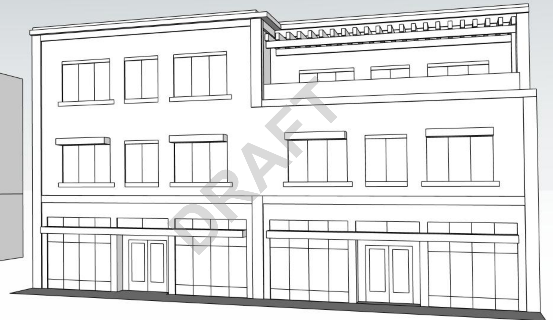
Potential architectural expression and detail standards - excluding materials